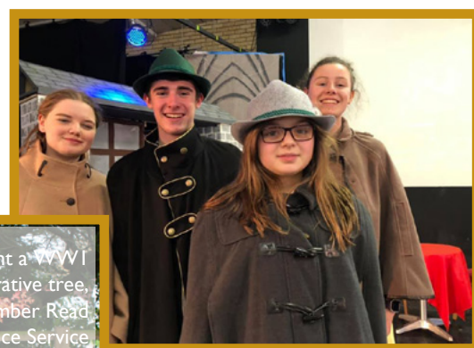
▲ Senior School pupils as the Von Trapp family in the Sound of Music