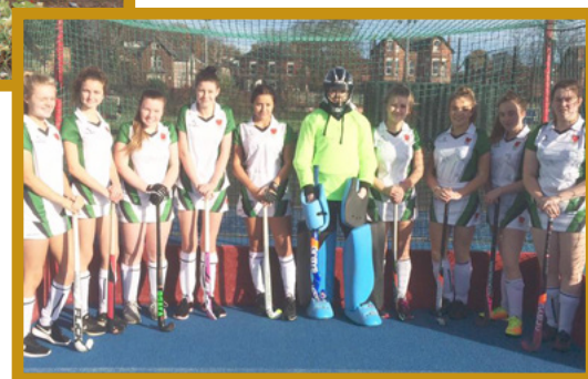
Read School 1st team enjoyed an ▲ excellent hockey season