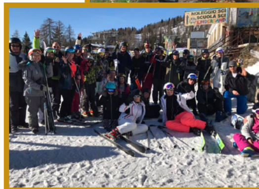
February half term ski trip to Folgarida, Italy ►